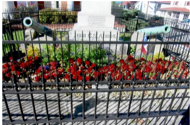
Flowers at Confederate Monument in Fincastle