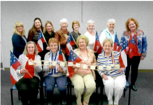
Fincastle 797 Members holding flags

We are looking forward to giving a New Member her Membership Certificate at our next meeting and have three more in the process. This is really a pleasure. We look forward to the Convention in October and hope this Corona virus will be long gone.