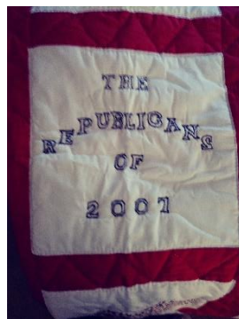
Probable Date 2007