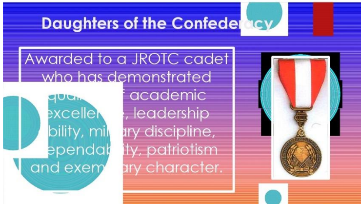
Criteria for JROTC Medal

We hope everyone will continue to be well and look forward to seeing you in October at the Virginia Division Convention.